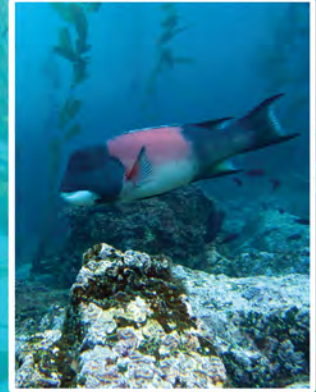
California Sheephead Semicossyphus pulcher