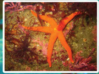
Sea Star Echinaster sepositus