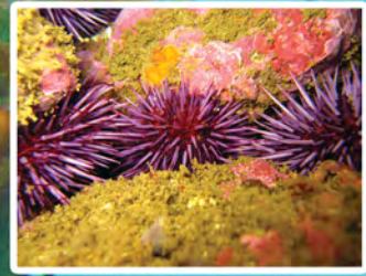
Purple Sea Urchin Strongylocentrotus purpuratus