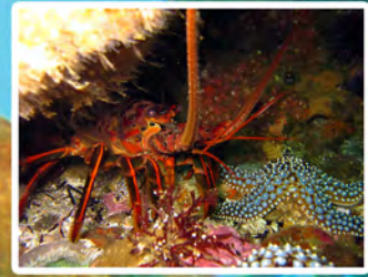
California Spiny Lobster Panulirus interruptus