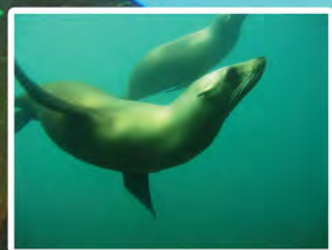
Sea Lion Zalophus californianus